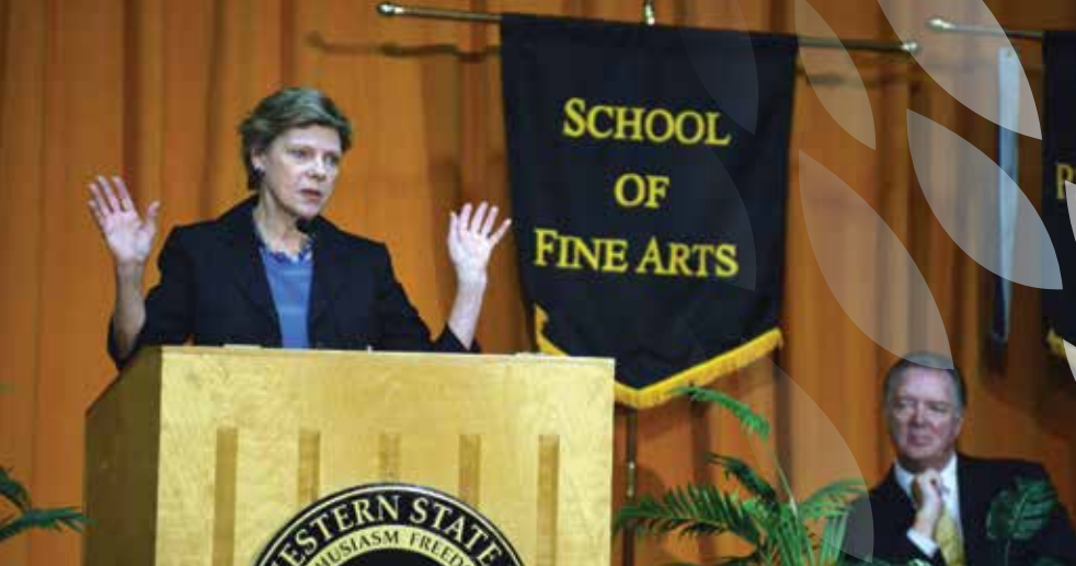
Cokie Roberts speaks at the 2016 R. Dan Boulware Convocation on Critical Issues

and programs. Last year, undesignated gifts to the Foundation funded or helped fund Visual Arts Day for high schoolers, guest speakers, Potter Art Gallery exhibitions and visiting artists, amphibian habitat field recording equipment, and more.